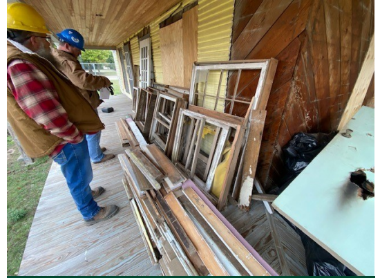
MOBILIZATION & CATALOGING

*Including $2,055,059 approved this project cycle on January 18, 2021 and previously approved $150,000 for the Heritage Pavilion.